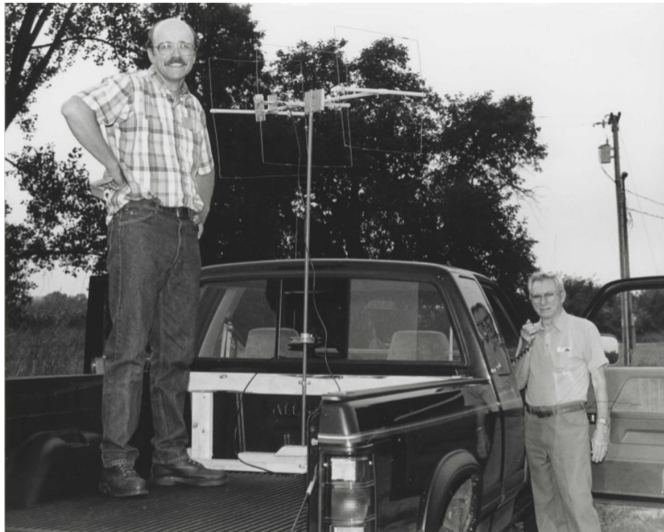
WB9WHG & W9MPP